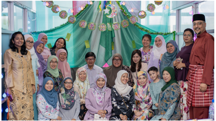
PAPRSB Institute of Health Sciences staff members celebrating Hari Raya Aidilfitri in May.

You may freely distribute copies of this newsletter and information about the PAPRSB Institute of Health Sciences to any interested parties.