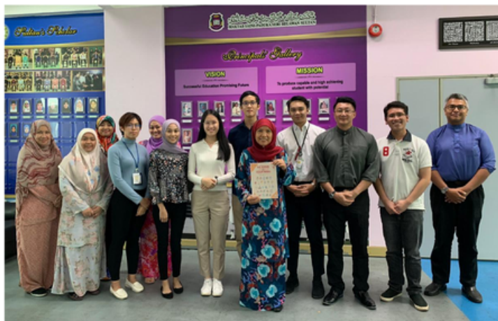
Top left: VITAL team at their afternoon talk with students from SMSA. Top right: Students attending VITAL booth for personalised health discussion. Bottom: Meeting and sharing session with the administration staff members of Maktab Sains PSBS