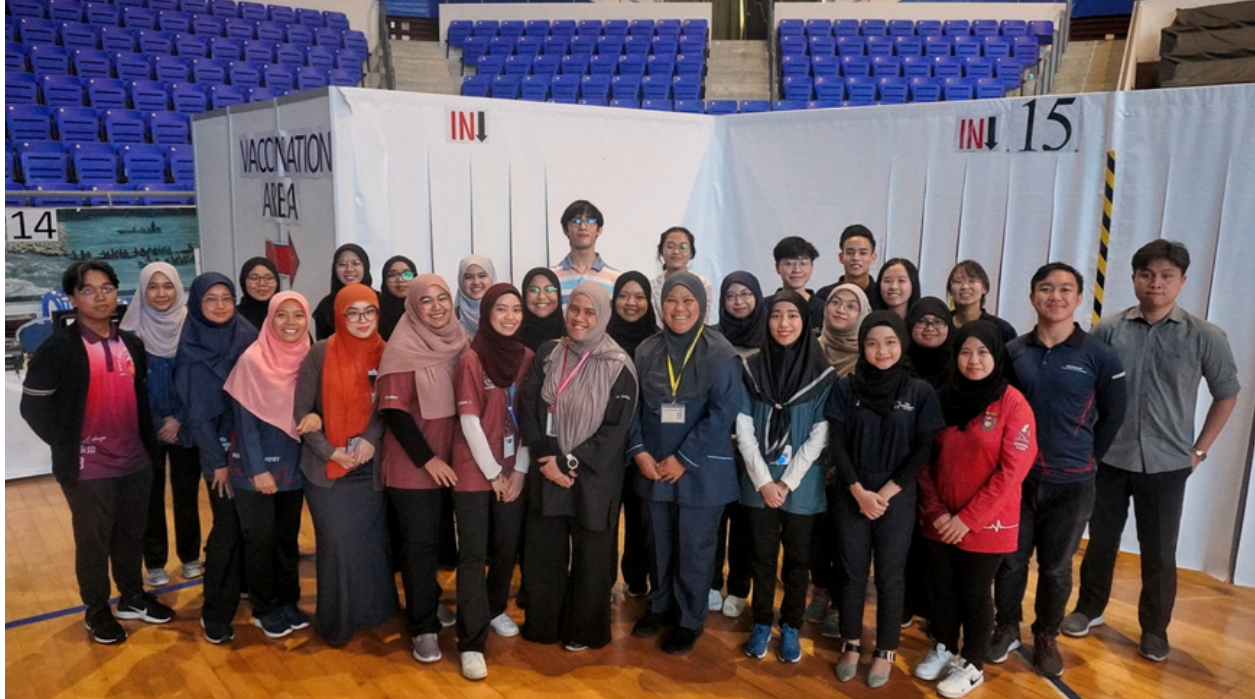
PAPRSB Institute of Health Sciences staff members and students volunteered for Brunei COVID-19 National Immunisation Programme at the Indoor Stadium (read more on Page 2).

PAPRSB Institute of Health Sciences, Universiti Brunei Darussalam Quarterly Newsletter