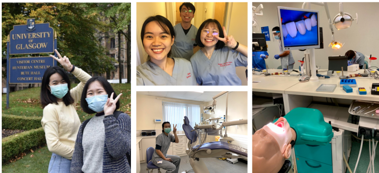
Left: Two dental students of Cohort 1 exploring campus of University of Glasgow, United Kingdom. Top middle: the students in their new dental scrubs. Middle bottom: one of the students at her Paediatric clinical placement at Springburn Health Centre. Right: Pre-clinical practical session on a phantom head at University of Glasgow.

We think that our preparation while at PAPRSB Institute of Health Sciences, UBD has helped us with a seamless transition to the University of Glasgow. On this final note, we would also like to express our gratitude to His Majesty and the Government of Brunei Darussalam for this scholarship, and our lecturers and supervisors at PAPRSB Institute of Health Sciences and National Dental Clinic of Ministry of Health Brunei, who have guided us and this far.