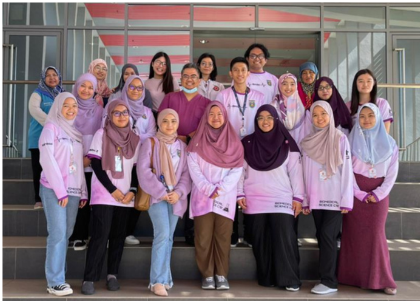
Top: Staff members of the Blood Donation Centre, RIPAS Hospital came to help with the blood donation drive on site. Bottom: Year 2 Biomedical Science students (Cohort 12) pictured together with staff members of the Blood Donation Centre, RIPAS Hospital.