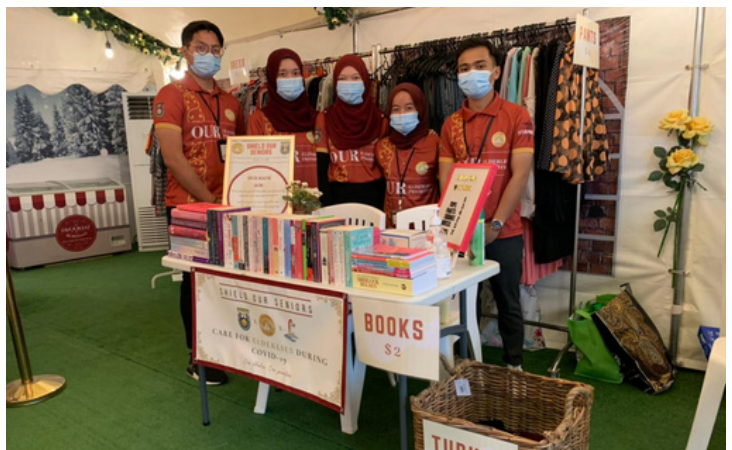
Top photo: Members of the Shield Our Senior team. Bottom photo: SOS team at their fundraising campaign to raise funds for Pusat Kegiatan Warga Emas.