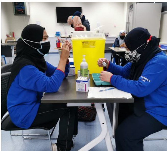
Students preparing vaccines at the central processing area of UBD Vaccination Centre.

The overall experience was positive and gratifying. However, it would be untrue to say that the anxiety never kicked in for me – it did. I'm sure my colleagues have felt the same at one point or another. The realisation hit especially when the announcement of the 2nd pandemic wave came. There were constant updates in SOPs, dynamics, etc to make sure the vaccination process more systematic and streamlined for the public. However, with the given sets of challenges, the COVID-19 team from both UBD and indoor stadium has always been very supportive of our growth. I would like to thank the teams involved and MOH for giving us the opportunity to serve the community.