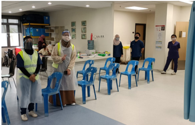
Left photo: Volunteers comprised of students of PAPRSB IHS ready to receive the general public in the vaccination area that houses multiple private cubicles where vaccines are administered. Right photo: The area where members of the public are situated in the waiting area before being ushered into their cubicles to receive their vaccines.