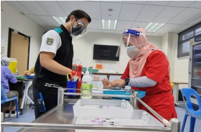
Left photo: Volunteers in the Central Processing Area (CPA) preparing vaccines prior to their distribution for the general public. Right photo: students of PAPRSB IHS withdrawing COVID-19 vaccines into syringes in CPA.