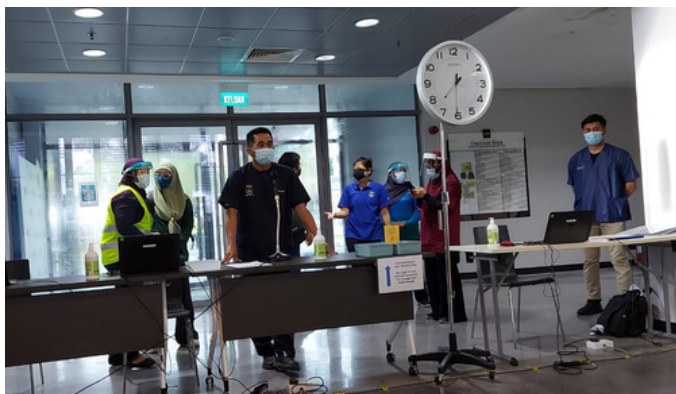
Left photo: PAPRSB IHS faculty members monitor individuals who have just received their vaccinations for any potential adverse events post-vaccination in the Observation Area. Right photo: the UBD VC is overseen by a group of UBD and PAPRSB IHS staff members to ensure a smooth daily operation.