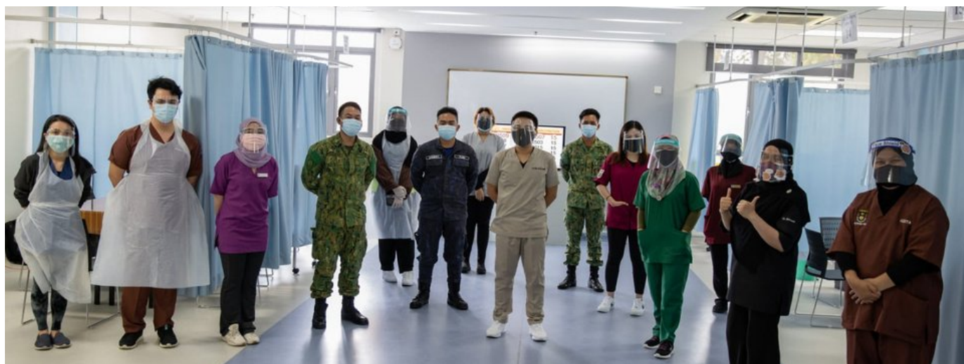
A photo featuring some of officers from the Royal Brunei Armed Forces' (RBAF) who helped with the running of the UBD Vaccination Centre.

I would say registering patients is a relatively simple task. However, the language barrier and the lack of clarity in communication can be challenging. This has taught me how to properly and effectively interact with patients or the public, which I would not have much opportunity for within my programme.