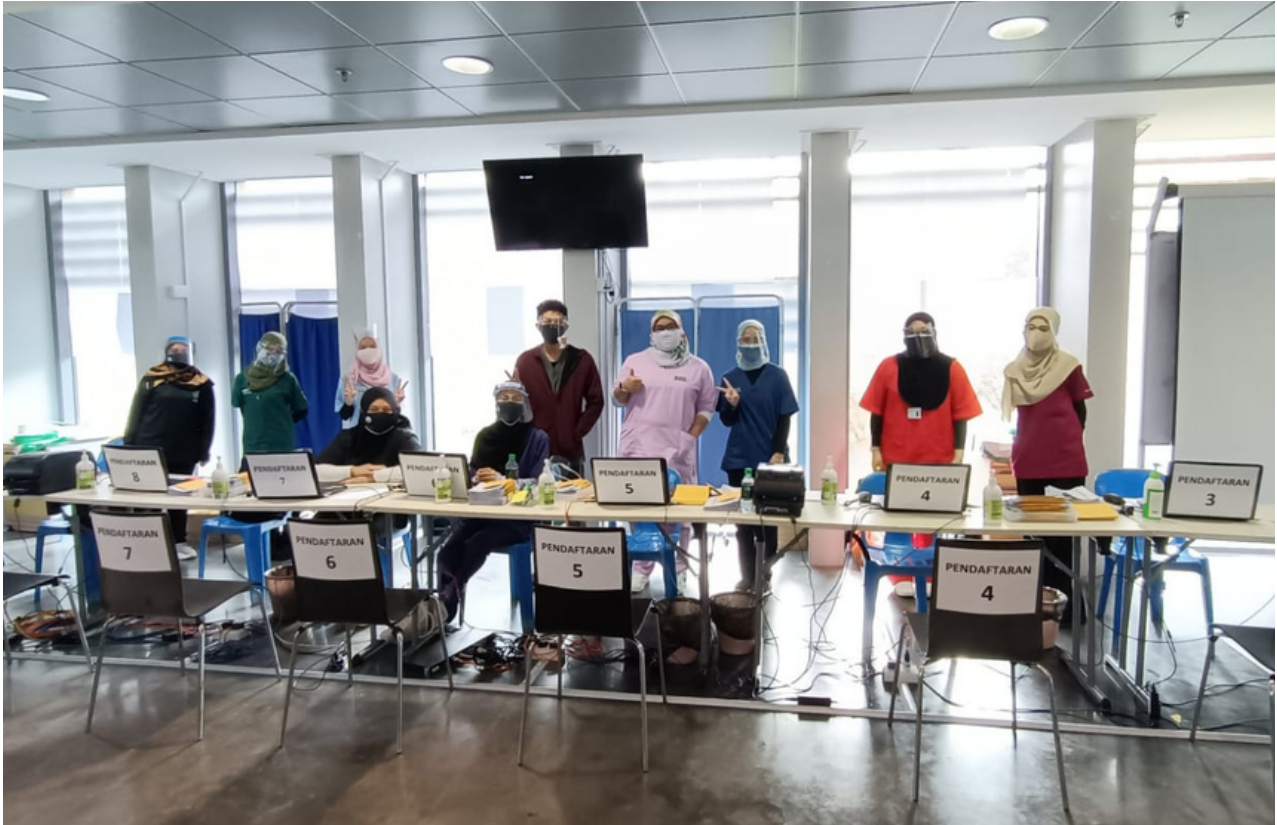
PAPRSB Institute of Health Sciences staff members and student volunteers at UBD Vaccination Centre (read more on Page 2).

PAPRSB Institute of Health Sciences, Universiti Brunei Darussalam Quarterly Newsletter