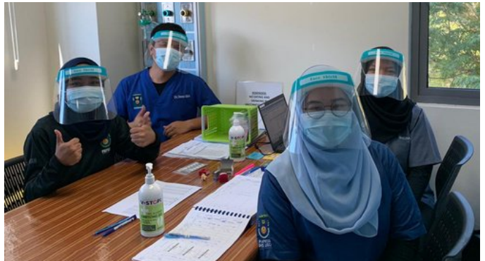
Volunteers in a vaccination cubicle who helped as data loggers and verifiers and a vaccinator.