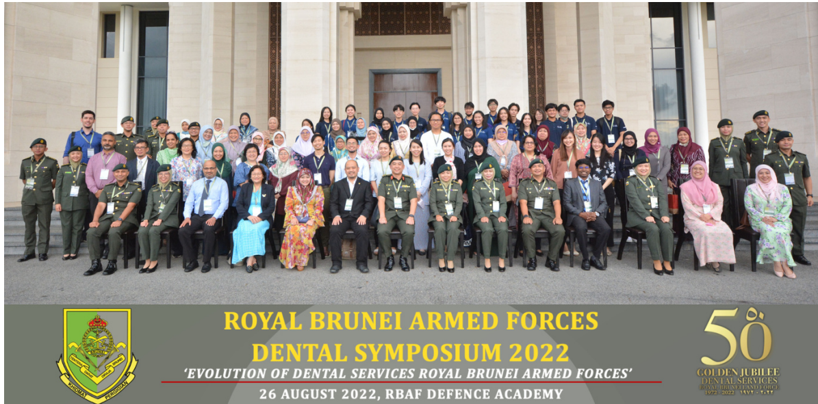
Group photo of Dental Symposium 2022 attendees outside the Ceremonial Hall at Defence Academy Royal Brunei Armed Forces.