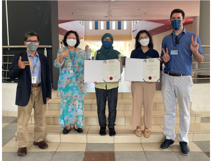
Two dental students from Cohort 3 (middle) pictured together with their lecturers were awarded scholarship to continue their studies and training at the University of Glasgow.

A total of 25 medical students from Cohort 15 have transferred to the University of Glasgow, University College Cork, University of Southampton, the University of Ireland Galway, University of Dundee, Trinity College Dublin of the University of Dublin, the University of New South Wales. Meanwhile, seven dental students from Cohort 3 are currently placed at the University of Glasgow, Newcastle University and University of Dundee.