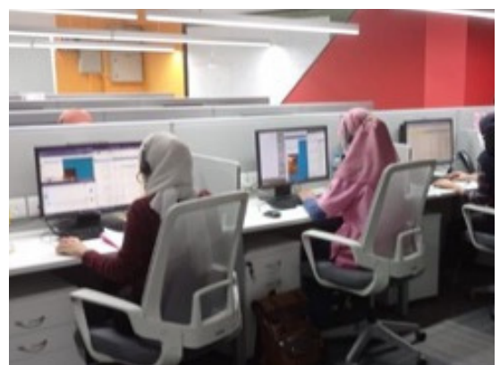
Two PAPRSB IHS student volunteers helping COVID-19 patients on the line at the Patient Management Team (PMT) Call Centre.