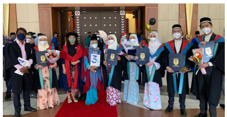
Left photo: His Majesty graced the 34th UBD Convocation event on the 22nd of August. Right photos: PAPRSB IHS student graduates took an opportunity to take commemorative photos with their lecturers after the event.