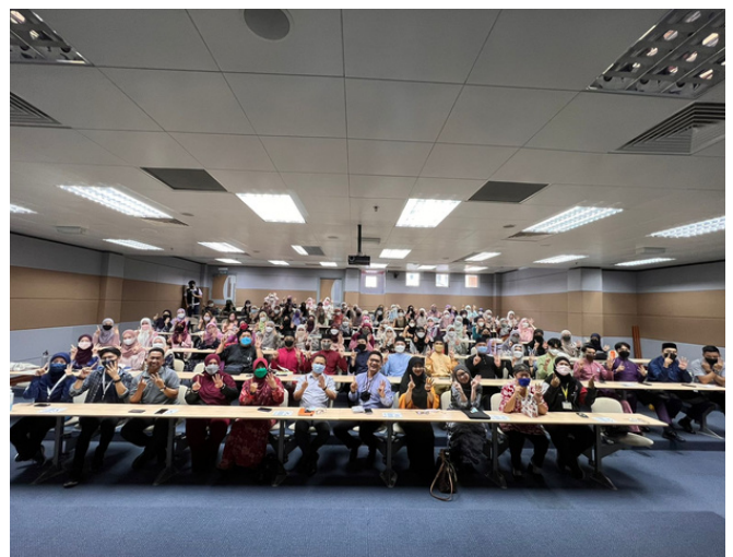
Top panel: Fresh intake of BHSc Biomedical Science students (Cohort 15) and BHSc Dentistry students (Cohort 6) listening to briefing. Bottom panel: BHSc Pharmacy and BHSc Midwifery & Nursing programmes in commemorative group photos taken at the end of their briefing sessions.