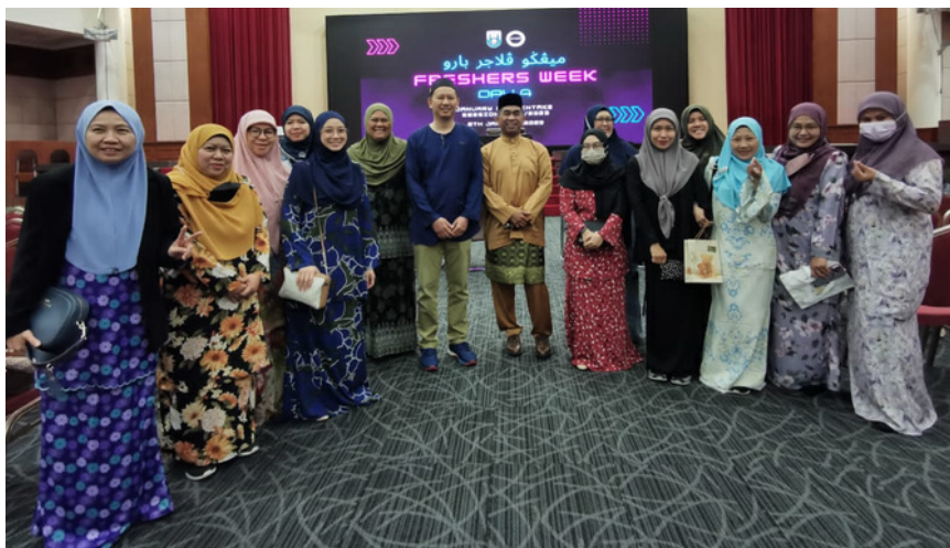
Academic and administrative staff members of PAPRSB Institute of Health Sciences attended the opening ceremony of Quranic Journey at UBD Chancellor Hall on the 6th of January, 2023.

You may freely distribute copies of this newsletter and information about the PAPRSB Institute of Health Sciences to any interested parties.