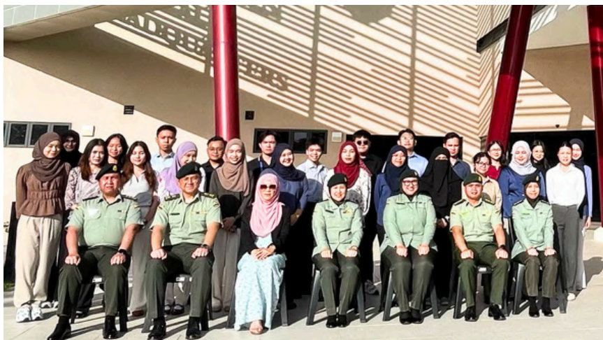
Year 3 students from Cohort 18 of the BHSc Medicine programme paid an educational visit to the Medical Reception Station (MRS) at Bolkiah Garrison, Ministry of Defence, on 28 February 2025.

You may freely distribute copies of this newsletter and information about the PAPRSB Institute of Health Sciences to any interested parties.