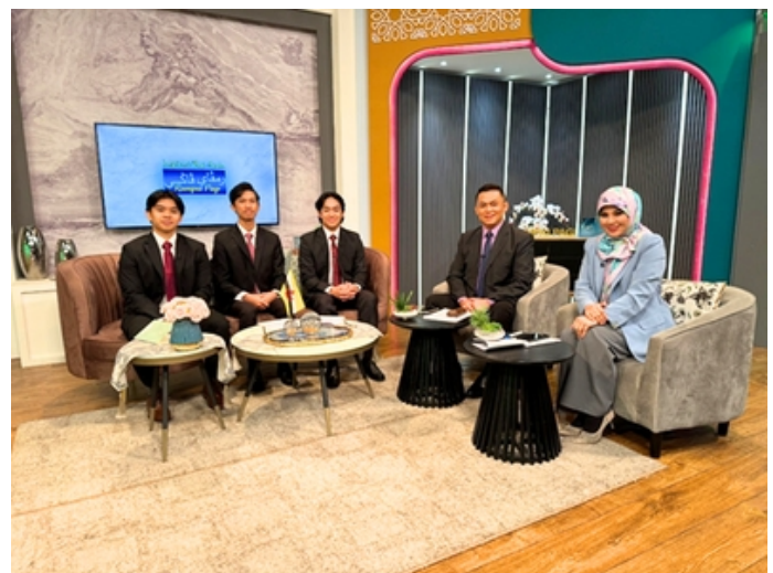
Top: HEARTS demonstrating CPR skills to community. Bottom left: A picture with Minister of Health during one of HEARTS BKC event. Bottom right: Picture during HEARTS' feature in RTB's Rampai Pagi.